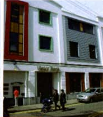
Ulster Bank Wexford